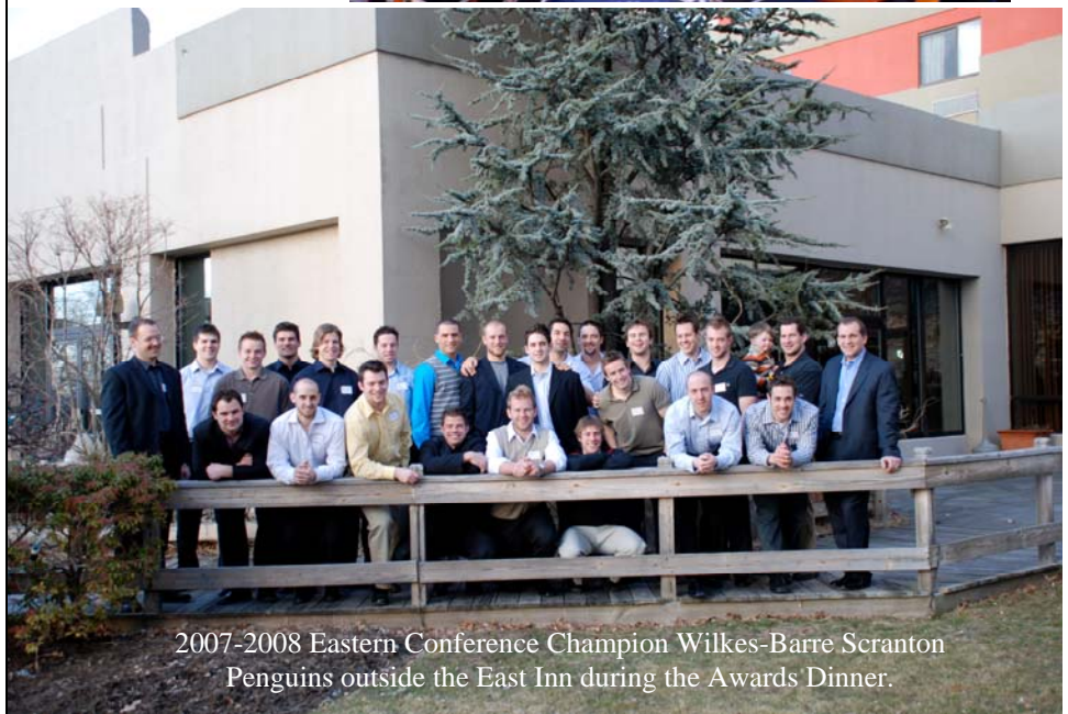
2007-2008 Eastern Conference Champion Wilkes-Barre Scranton Penguins outside the East Inn during the Awards Dinner.